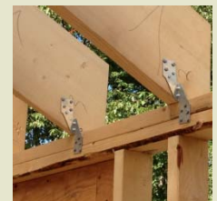
Hurricane clips on roof trusses