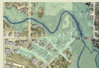
Floodplain and Stormwater Management

A wide range of hazard mitigation options are being considered, from small individual actions to larger scale community projects.