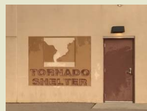
Community Storm Shelter